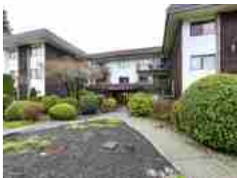
#210 - 175, 5 th Street East, North Vancouver, B.C.